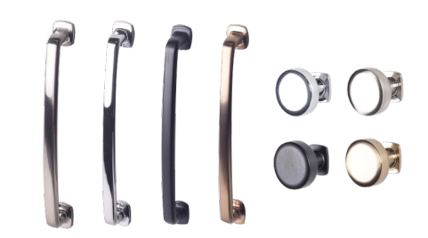
Cottage Satin Nickel, Chrome, Matte Black, Rose Gold 5-7/8", 7-1/4"; 1-7/32" Knob