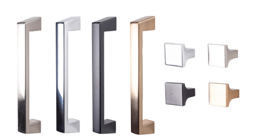
Loft Satin Nickel, Chrome, Matte Black, Rose Gold 5-7/8", 7-1/8"; 15/16" Knob