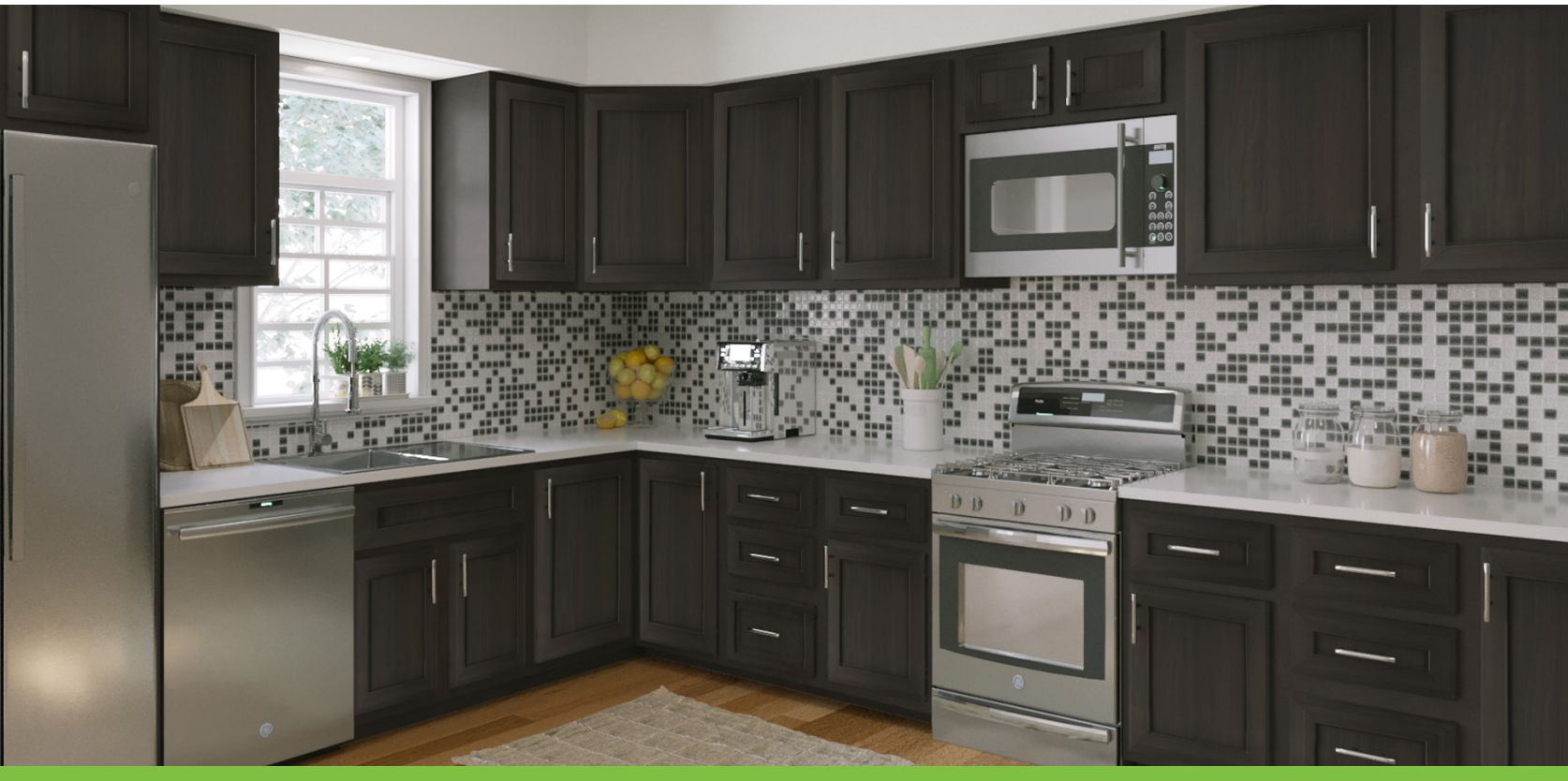
Shaker Classic Espresso

KitchenMakeover.com provides quick delivery and huge savings compared to full cabinet replacement. Our kit and video instructions are all you need to easily rejuvenate your kitchen and bath.