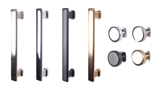
Artisan Satin Nickel, Chrome, Matte Black, Rose Gold 6-1/16", 7-5/16"; 1-7/32" Knob