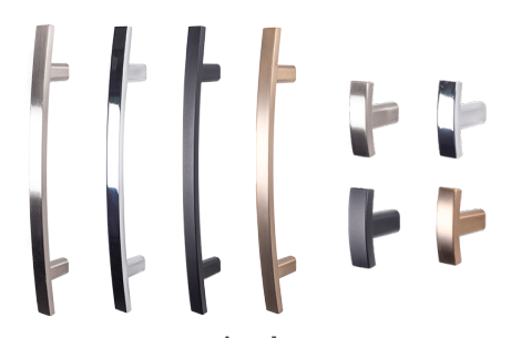
Arch Satin Nickel, Chrome, Matte Black, Rose Gold 6", 7-1/8"; 1-7/16" Knob