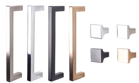
Square Satin Nickel, Chrome, Matte Black, Rose Gold 5-7/16", 6-11/16"; 15/16" Knob