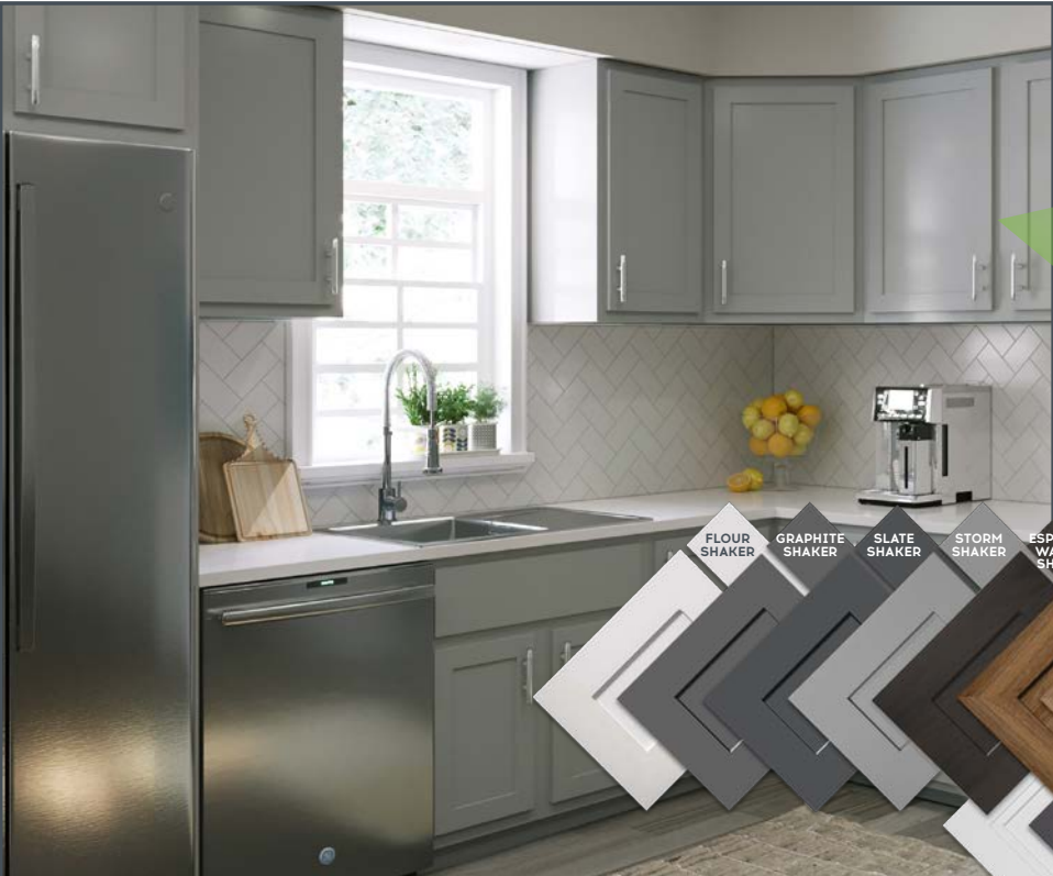
Shaker Fusion Storm

FUSION: Slab drawer fronts in combination with 5-piece door fronts.