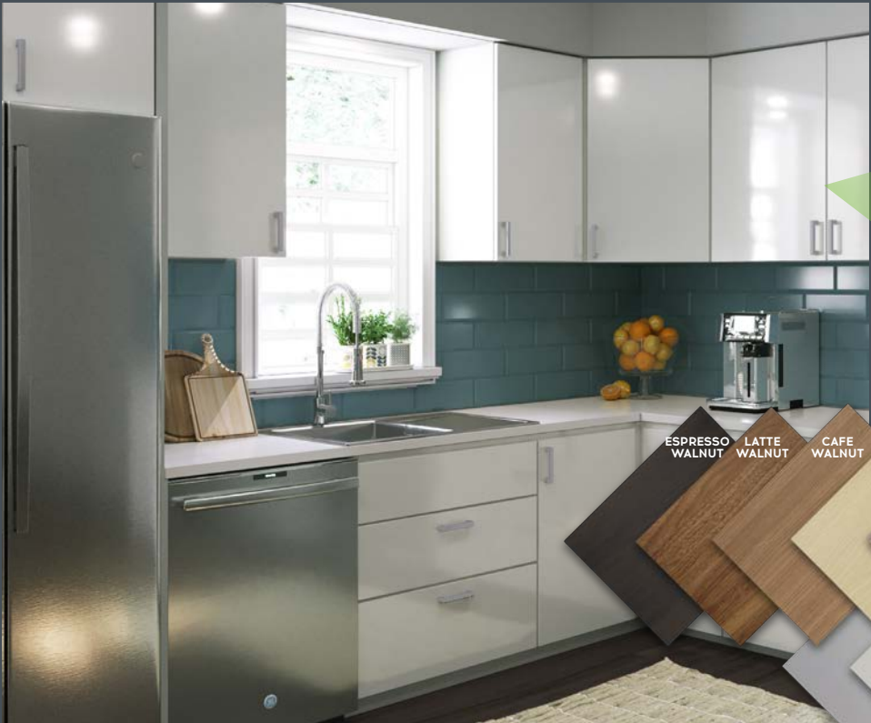
Snow Gloss Slab

SLAB: A clean, modern look available in 12 colors and a primed-for-paint option.